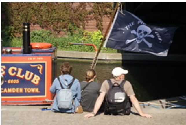
[11] Cavalcade 2011 [11]