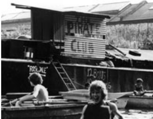
[1]12 boats, 10 canoes, 100 members or so, at the Pirate Club on