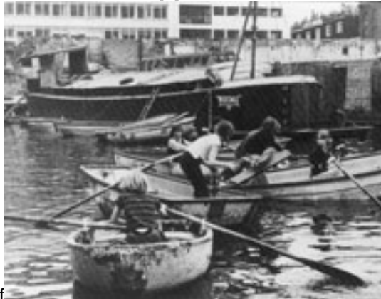
Rosedale at Gilbeys Wharf

[2]Way before elven safety was invented, you didn't have to have a lifejacket as long as you could swim ok in your clothes, or something like that