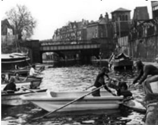
[3]Voluntary work on the canal means you also get out of it what other

[2]Way before elven safety was invented, you didn't have to have a lifejacket as long as you could swim ok in your clothes, or something like that